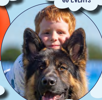
HAVE A GO EVENTS