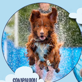
COMPANION DOG SHOW