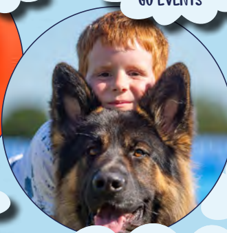
HAVE A GO EVENTS