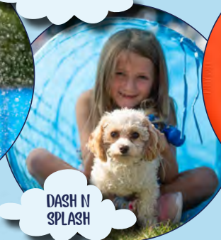
DASH N SPLASH