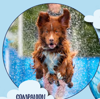
COMPANION DOG SHOW